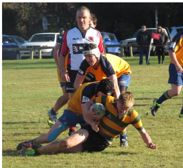
2 nd XV against Kaiapoi