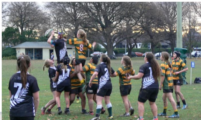
Pictured above and left: Girls 1 st XV in action against Forward Foundation in Hagley Park